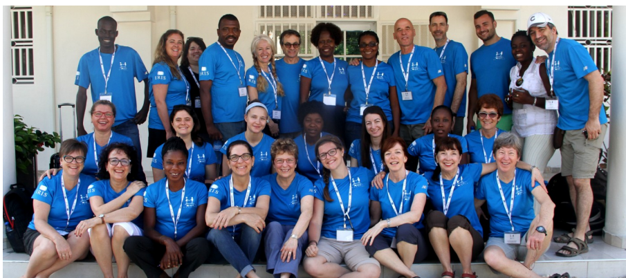
2016 mission team in Miragoane, Haiti